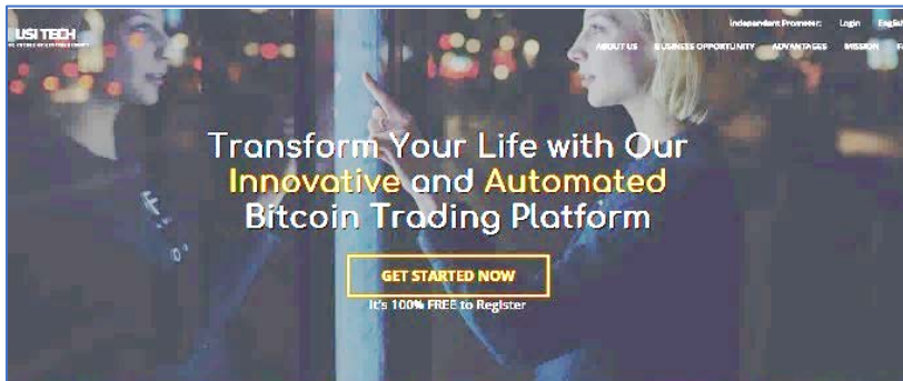
An online advertisement by USI-Tech

Six of the 32 offerings subject to the sweep involved the payment of a "finder's fee" or some other type of commission to investors who brought new persons into the scheme.